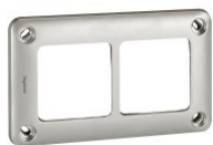
PLATE SOLIROC - 2 GANG - 110 X 181 MM - HORIZONTAL OR VERTICAL - IK10