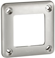
PLATE SOLIROC - 1 GANG - 110 X 110 MM - IK10