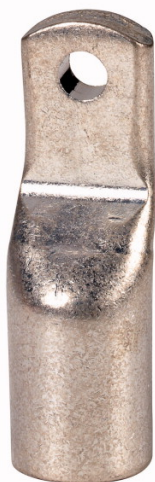
Cable lug, 300mm 2

Part no. NZM3-XKS300 Catalog No. 153186 Alternate Catalog No. NZM3-XKS300