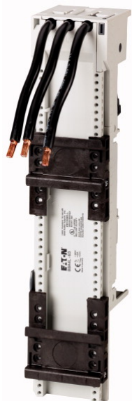
Busbar adapter, 55mm, 63A, 2TS

Part no. BBA4L-63 Catalog No. 101459 Eaton Catalog No. BBA4L-63 EL-Nummer 2465054 (Norway)