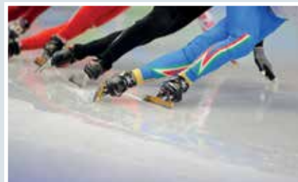
Chiller with brine application (process, ice rink...)