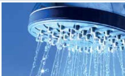
Hot sanitary water production

The PSH 051-077 compressors comply with both market demands and legislation regarding sound levels. The compressor generates an average sound level 3 dB(A) lower than equivalent products. All PSH compressors are suitable with a patented Surface Sump Heater (SSH) with integrated insulation, which largely contributes to the reduction in sound level. PSH 051-64-77 are fitted as standard with a SSH. For PSH 019-039, it is a recommended option for sound reduction and end-user comfort. It can be installed on one side of the shell body.