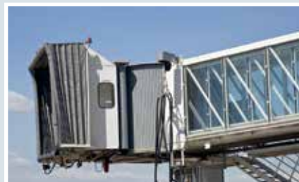
Special air conditioning application (boarding bridges...)