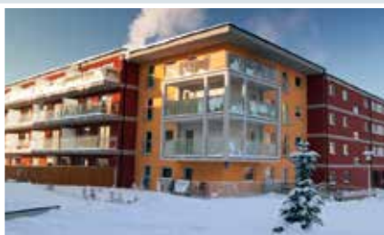
Heating for office and multi-family buildings for low ambient countries (air/water, water/water, brine/water)