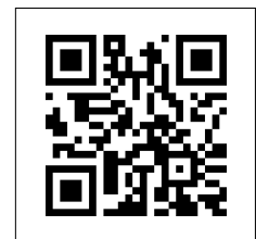
Scan QR code for more technical information and code numbers