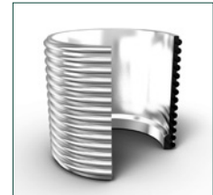
Flexible two-in-one connection