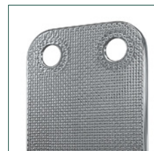
Innovative micro plate design