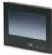
17.8 cm (7") TFT color display