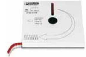
Conductor cross sections from 0.25 to 8 mm 2