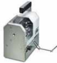
Conductor cross sections from 0.25 to 2.5 mm 2

Notes: An application video can be found in the download area for the relevant product on our website at www.phoenixcontact.net/products .