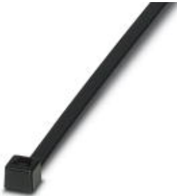
Cable binders for quick and secure bundling, standard version

Please be informed that the data shown in this PDF Document is generated from our Online Catalog. Please find the complete data in the user's documentation. Our General Terms of Use for Downloads are valid ( http://phoenixcontact.com/download )