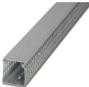
Cable duct, light gray, halogen-free, consisting of upper part and mounting base, width: 80 mm, height: 60 mm, length: 2000 mm

Please be informed that the data shown in this PDF Document is generated from our Online Catalog. Please find the complete data in the user's documentation. Our General Terms of Use for Downloads are valid ( http://phoenixcontact.com/download )