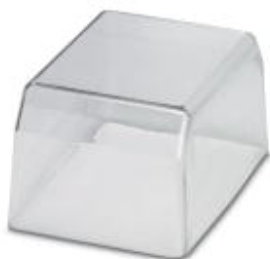
Cover, for the contact- and dust-protected encapsulation of the components

Please be informed that the data shown in this PDF Document is generated from our Online Catalog. Please find the complete data in the user's documentation. Our General Terms of Use for Downloads are valid ( http://phoenixcontact.com/download )