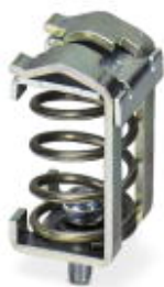
Shield connection terminal block, for applying the shield directly to the conductive mounting plates

Please be informed that the data shown in this PDF Document is generated from our Online Catalog. Please find the complete data in the user's documentation. Our General Terms of Use for Downloads are valid ( http://phoenixcontact.com/download )