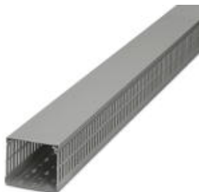
Cable duct, gray, consisting of upper and lower part, width: 100 mm, height: 80 mm, length 2000 mm

Please be informed that the data shown in this PDF Document is generated from our Online Catalog. Please find the complete data in the user's documentation. Our General Terms of Use for Downloads are valid ( http://phoenixcontact.com/download )