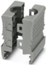
Cable housing, Length: 19.9 mm, Width: 45.5 mm, Height: 36.8 mm, Number of positions: 13, Color: gray

Please be informed that the data shown in this PDF Document is generated from our Online Catalog. Please find the complete data in the user's documentation. Our General Terms of Use for Downloads are valid ( http://phoenixcontact.com/download )