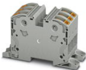
High-current terminal block, Connection method: Power-Turn connection, Cross section: 2.5 mm 2 - 35 mm 2 , AWG: 12 - 2, Width: 48 mm, Height: 68.3 mm, Color: gray, Mounting type: NS 35/15

Please be informed that the data shown in this PDF Document is generated from our Online Catalog. Please find the complete data in the user's documentation. Our General Terms of Use for Downloads are valid ( http://phoenixcontact.com/download )