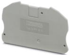
End cover, Length: 75.4 mm, Width: 2.2 mm, Color: gray

Please be informed that the data shown in this PDF Document is generated from our Online Catalog. Please find the complete data in the user's documentation. Our General Terms of Use for Downloads are valid ( http://phoenixcontact.com/download )