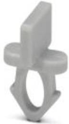
Spacer, Color: white

Please be informed that the data shown in this PDF Document is generated from our Online Catalog. Please find the complete data in the user's documentation. Our General Terms of Use for Downloads are valid ( http://phoenixcontact.com/download )