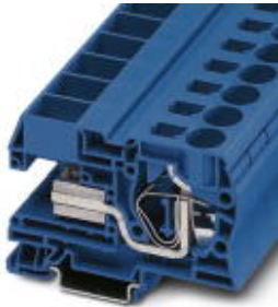
N disconnect terminal block, Spring-cage connection, Cross section: 2.5 mm 2 - 35 mm 2 , AWG: 14 - 2, Width: 16 mm, Color: blue, Mounting type: NS 35/15, NS 35/7,5

Please be informed that the data shown in this PDF Document is generated from our Online Catalog. Please find the complete data in the user's documentation. Our General Terms of Use for Downloads are valid ( http://phoenixcontact.com/download )