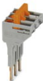
Switching jumper, Length: 21.2 mm, Width: 18.5 mm, Number of positions: 3, Color: gray/orange

Please be informed that the data shown in this PDF Document is generated from our Online Catalog. Please find the complete data in the user's documentation. Our General Terms of Use for Downloads are valid ( http://phoenixcontact.com/download )