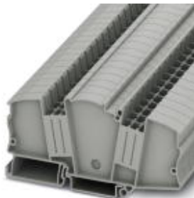
Spacer plate, Length: 100.8 mm, Width: 8.2 mm, Color: gray

Please be informed that the data shown in this PDF Document is generated from our Online Catalog. Please find the complete data in the user's documentation. Our General Terms of Use for Downloads are valid ( http://phoenixcontact.com/download )