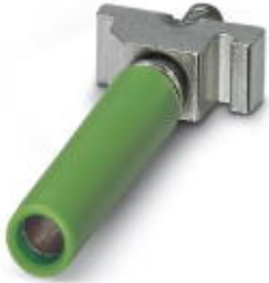
Female test connector, With slide, Color: green

Please be informed that the data shown in this PDF Document is generated from our Online Catalog. Please find the complete data in the user's documentation. Our General Terms of Use for Downloads are valid ( http://phoenixcontact.com/download )