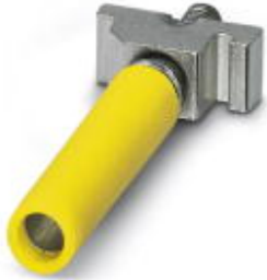
Female test connector, With slide, Color: yellow

Please be informed that the data shown in this PDF Document is generated from our Online Catalog. Please find the complete data in the user's documentation. Our General Terms of Use for Downloads are valid ( http://phoenixcontact.com/download )