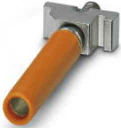
Female test connector, With slide, Color: orange

Please be informed that the data shown in this PDF Document is generated from our Online Catalog. Please find the complete data in the user's documentation. Our General Terms of Use for Downloads are valid ( http://phoenixcontact.com/download )