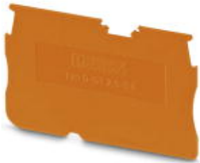
End cover, Length: 48.6 mm, Width: 0.8 mm, Height: 29 mm, Color: orange

Please be informed that the data shown in this PDF Document is generated from our Online Catalog. Please find the complete data in the user's documentation. Our General Terms of Use for Downloads are valid ( http://phoenixcontact.com/download )