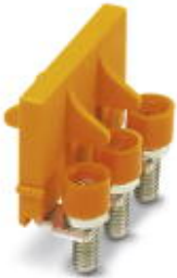
Switching jumper, Width: 23.5 mm, Number of positions: 3, Color: orange

Please be informed that the data shown in this PDF Document is generated from our Online Catalog. Please find the complete data in the user's documentation. Our General Terms of Use for Downloads are valid ( http://phoenixcontact.com/download )