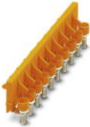
Switching jumper, Width: 80.9 mm, Number of positions: 10, Color: orange

Please be informed that the data shown in this PDF Document is generated from our Online Catalog. Please find the complete data in the user's documentation. Our General Terms of Use for Downloads are valid ( http://phoenixcontact.com/download )