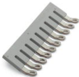
Insertion bridge, Number of positions: 10, Color: gray

Please be informed that the data shown in this PDF Document is generated from our Online Catalog. Please find the complete data in the user's documentation. Our General Terms of Use for Downloads are valid ( http://phoenixcontact.com/download )