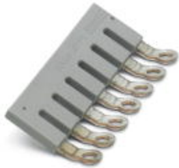
Insertion bridge, Number of positions: 7, Color: gray

Please be informed that the data shown in this PDF Document is generated from our Online Catalog. Please find the complete data in the user's documentation. Our General Terms of Use for Downloads are valid ( http://phoenixcontact.com/download )