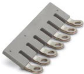
Insertion bridge, Number of positions: 7, Color: gray

Please be informed that the data shown in this PDF Document is generated from our Online Catalog. Please find the complete data in the user's documentation. Our General Terms of Use for Downloads are valid ( http://phoenixcontact.com/download )