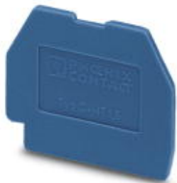
End cover, Length: 22 mm, Width: 1 mm, Color: blue

Please be informed that the data shown in this PDF Document is generated from our Online Catalog. Please find the complete data in the user's documentation. Our General Terms of Use for Downloads are valid ( http://phoenixcontact.com/download )