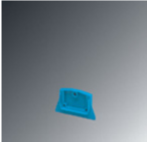
End cover, Length: 42.7 mm, Width: 4 mm, Color: blue

Please be informed that the data shown in this PDF Document is generated from our Online Catalog. Please find the complete data in the user's documentation. Our General Terms of Use for Downloads are valid ( http://phoenixcontact.com/download )