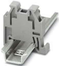
Snap-on end bracket, to be snapped onto NS 15 DIN rail

Please be informed that the data shown in this PDF Document is generated from our Online Catalog. Please find the complete data in the user's documentation. Our General Terms of Use for Downloads are valid ( http://phoenixcontact.com/download )