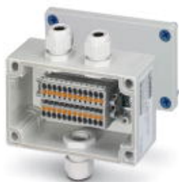
Terminal box, With 12 terminal blocks, 2.5 mm 2 with push-in technology, Material: ABS, gray, 130 mm x 80 mm x 60 mm, Type of locking: Screw-on cover

Please be informed that the data shown in this PDF Document is generated from our Online Catalog. Please find the complete data in the user's documentation. Our General Terms of Use for Downloads are valid ( http://phoenixcontact.com/download )