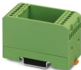
Electronic housing, with snap foot for DIN rail EN 50022 for PCB insertion, without screw connection terminal blocks and cover

Please be informed that the data shown in this PDF Document is generated from our Online Catalog. Please find the complete data in the user's documentation. Our General Terms of Use for Downloads are valid ( http://phoenixcontact.com/download )