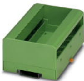
Electronic housing, for PCB insertion, without screw connection terminal blocks and cover, with lateral opening for connector

Please be informed that the data shown in this PDF Document is generated from our Online Catalog. Please find the complete data in the user's documentation. Our General Terms of Use for Downloads are valid ( http://phoenixcontact.com/download )