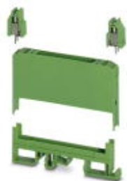
Electronic housing set, consisting of electronic housings and printed circuit termination blocks

Please be informed that the data shown in this PDF Document is generated from our Online Catalog. Please find the complete data in the user's documentation. Our General Terms of Use for Downloads are valid ( http://phoenixcontact.com/download )