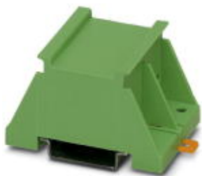
Mounting plate for screwing on switchgear, high-profile version

Please be informed that the data shown in this PDF Document is generated from our Online Catalog. Please find the complete data in the user's documentation. Our General Terms of Use for Downloads are valid ( http://phoenixcontact.com/download )