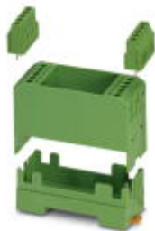
Electronic housing set, consisting of electronic housing and printed circuit termination blocks, pitch 5

Please be informed that the data shown in this PDF Document is generated from our Online Catalog. Please find the complete data in the user's documentation. Our General Terms of Use for Downloads are valid ( http://phoenixcontact.com/download )