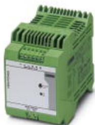
Primary-switched MINI POWER power supply for DIN rail mounting, input: 1-phase, output: 24 V DC/4 A

Please be informed that the data shown in this PDF Document is generated from our Online Catalog. Please find the complete data in the user's documentation. Our General Terms of Use for Downloads are valid ( http://phoenixcontact.com/download )