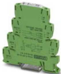
Timer relay with off delay (with control contact) and an adjustable time range (0.1 s - 10 s), with screw connection

Please be informed that the data shown in this PDF Document is generated from our Online Catalog. Please find the complete data in the user's documentation. Our General Terms of Use for Downloads are valid ( http://phoenixcontact.com/download )