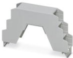
Component housing, Upper part, Color: light gray, Width: 22.5 mm, Constructional height: 51.5 mm

Please be informed that the data shown in this PDF Document is generated from our Online Catalog. Please find the complete data in the user's documentation. Our General Terms of Use for Downloads are valid ( http://phoenixcontact.com/download )