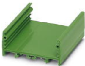
Panel mounting base, Lower part, Color: green, Width: 1000 mm, Note: required profile length = PCB length - 3 mm

Please be informed that the data shown in this PDF Document is generated from our Online Catalog. Please find the complete data in the user's documentation. Our General Terms of Use for Downloads are valid ( http://phoenixcontact.com/download )