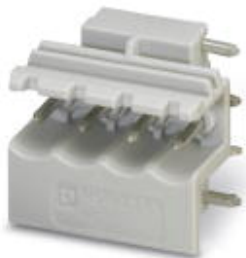
Header, Nominal current: 12 A, Rated voltage (III/2): 320 V, Number of positions: 4, Pitch: 5 mm, Mounting: Soldering

Please be informed that the data shown in this PDF Document is generated from our Online Catalog. Please find the complete data in the user's documentation. Our General Terms of Use for Downloads are valid ( http://phoenixcontact.com/download )