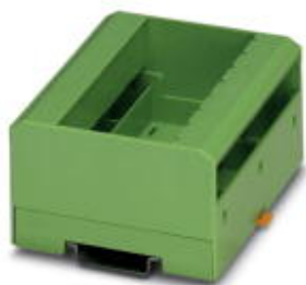
Electronic housing, for PCB insertion, without screw connection terminal blocks and cover, with lateral opening for connector

Please be informed that the data shown in this PDF Document is generated from our Online Catalog. Please find the complete data in the user's documentation. Our General Terms of Use for Downloads are valid ( http://phoenixcontact.com/download )