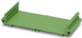
The illustration shows the variant UM 45-Profil CM

Panel mounting base Open, Lower part, Cross connection: without bus connector, Color: green, Width: 1000 mm, Number of positions cross connector: not relevant, Note: required profile length = PCB length - 3.6 mm