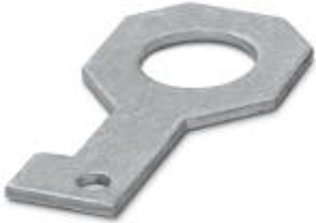
Plate for fixing the FLT-ISG-100-EX isolating spark gap to a flange, drill hole diameter of 39 mm.

Please be informed that the data shown in this PDF Document is generated from our Online Catalog. Please find the complete data in the user's documentation. Our General Terms of Use for Downloads are valid ( http://phoenixcontact.com/download )