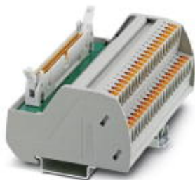
VARIOFACE interface module, with push-in connection for MODICON® TSX Quantum, with MODICON®-specific labeling, for I/O of 32 channels

Please be informed that the data shown in this PDF Document is generated from our Online Catalog. Please find the complete data in the user's documentation. Our General Terms of Use for Downloads are valid ( http://phoenixcontact.com/download )