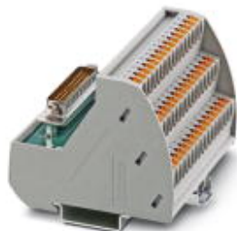
VARIOFACE module, with push-in connection and high density D-SUB miniature socket strip, for mounting on NS 35, no. of pos.: 15

Please be informed that the data shown in this PDF Document is generated from our Online Catalog. Please find the complete data in the user's documentation. Our General Terms of Use for Downloads are valid ( http://phoenixcontact.com/download )