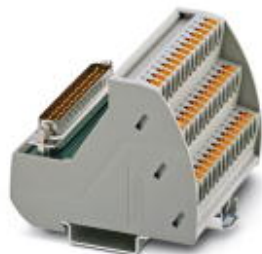
VARIOFACE module, with push-in connections and male D-SUB miniature pin strip, for mounting on NS 35 rails, 25-pos.

Please be informed that the data shown in this PDF Document is generated from our Online Catalog. Please find the complete data in the user's documentation. Our General Terms of Use for Downloads are valid ( http://phoenixcontact.com/download )