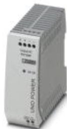
Primary-switched UNO POWER power supply for DIN rail mounting, input: 1-phase, output: 48 V DC/60 W

Please be informed that the data shown in this PDF Document is generated from our Online Catalog. Please find the complete data in the user's documentation. Our General Terms of Use for Downloads are valid ( http://phoenixcontact.com/download )